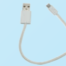
• USB Cable